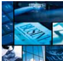
Software & Consulting