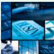
Software & Consulting

Information Systems, (Servers, Pc's, Storage, Printers, Plotters), Operating Systems (Operating Software, Databases, Security), Network (LAN's, WAN's, Routing, Switching, Network Management, Internet, Intranets)